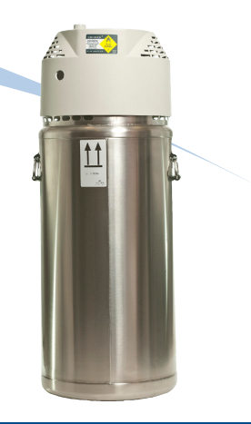
Chart Industries reserves the right to discontinue its products, or change the prices, materials, equipment, quality, descriptions, specifications and/or, processes to its products at any time without prior notice and with no further obligation or consequence. All rights not expressly stated herein are reserved by us, as applicable.

Chart BioMedical, Ltd. Unit 6, Ashville Way Wokingham RG41 2PL, United Kingdom Ph +44(0) 1189 367060 • Fax +44(0) 1189 799245